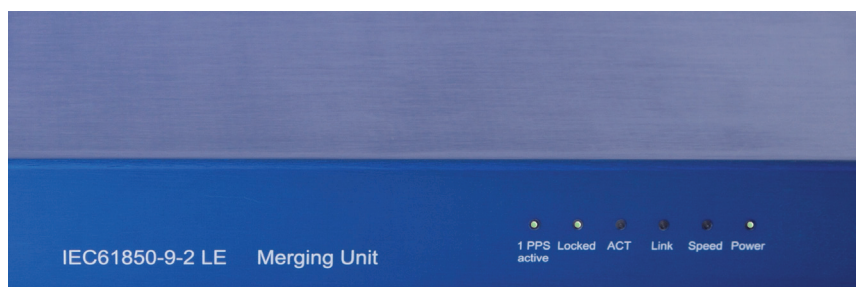
LED's displays the status of the SAMU