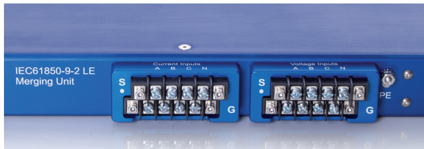
Detailed view of connectors